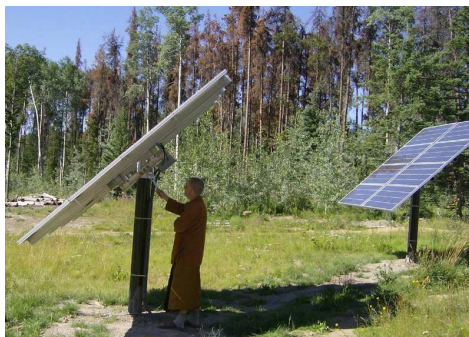
Following the sun: Ajahn manually turning the two solar arrays.

Installed in late June, throughout the summer 16 solar panels have proved their worth, reducing the use of our diesel generator by about 60 percent. Although the autumn sunlight now generates less power, on most days we see a few extra kilowatts stored in our battery bank.