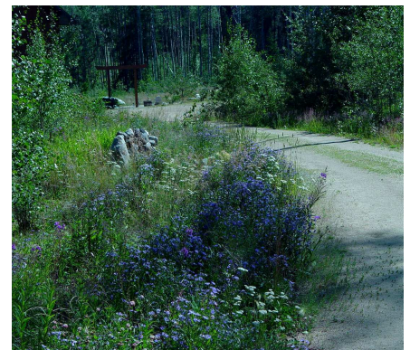
Summer wildflowers along the pathway.

with kataññuta ca mudita ca - a fellow traveller