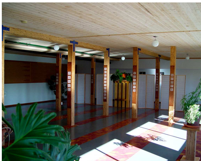
Renewed basement: pine ceiling and newly-painted walking paths.

Our final piece of practical news is to announce that a new tractor will soon be arriving at Birken! Earlier in the fall, a generous donor ordered a new John Deere for the monastery. The ma-