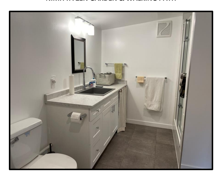
KUTI WASHROOM RENOVATION