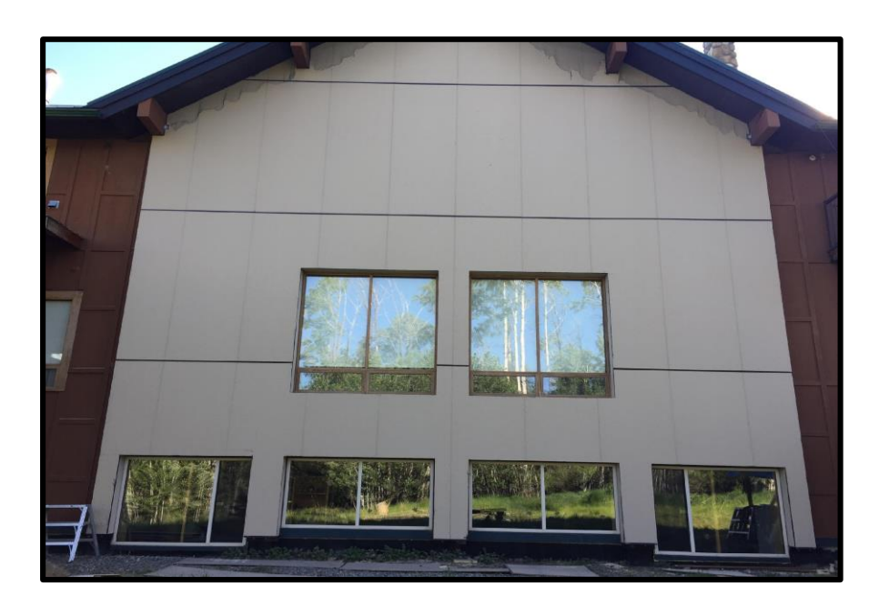
VIHARA EAST WALL INSULATION

After 20 years, and many septic back-ups, we finally replaced our main sewer line from the Vihara to the septic tank in September 2021. At the same time trenching and extension of a water line was completed to Nimitta House for the future addition of a washroom and sink for residents' use.