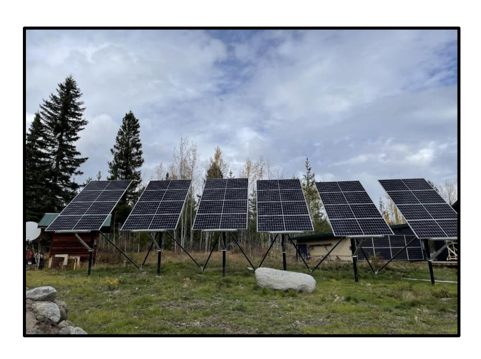
GROUND MOUNT SOLAR PANELS