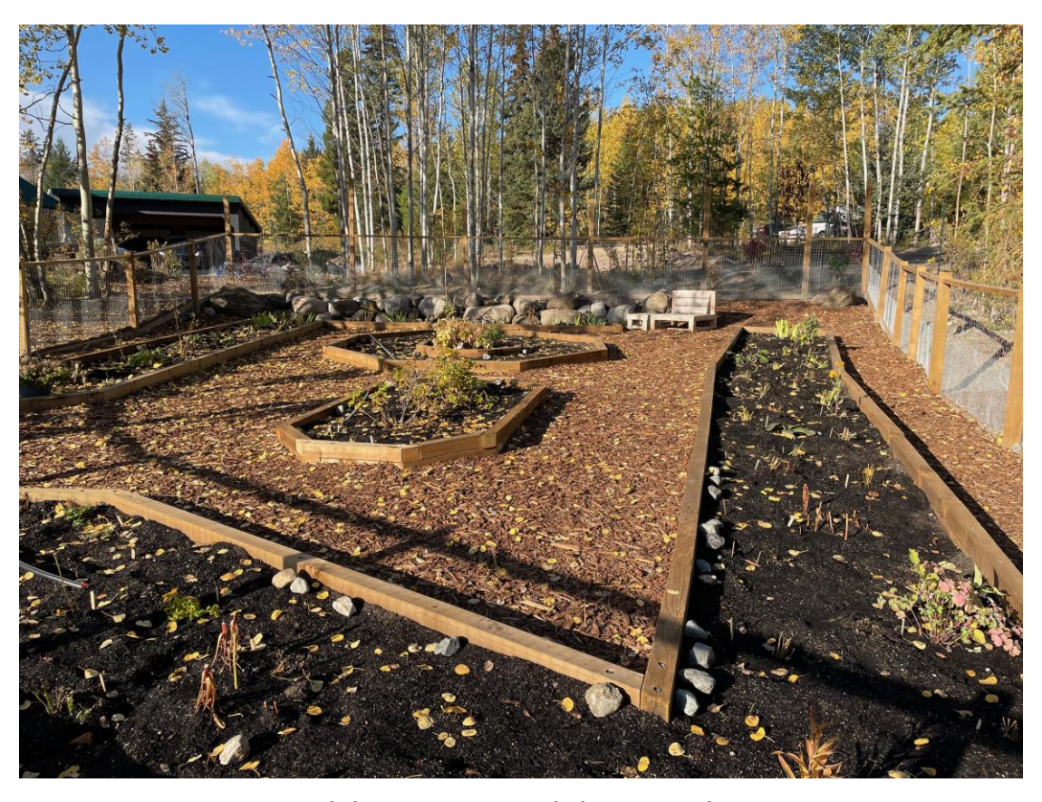
Ralph West Memorial Flower Garden