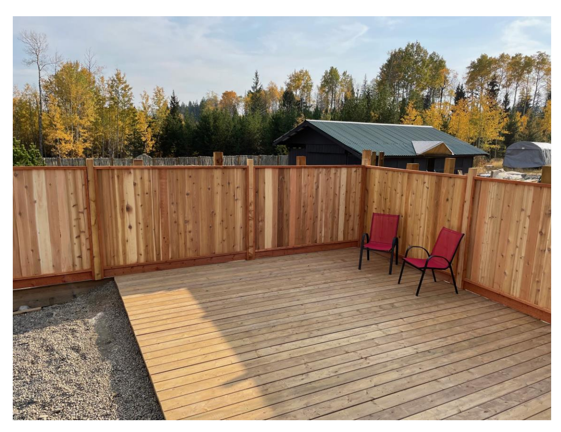
Nimitta Courtyard Garden