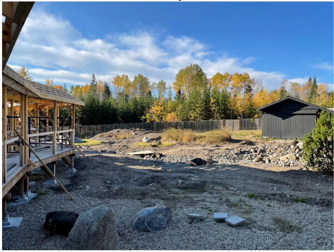
Vihara Japanese Stroll Garden