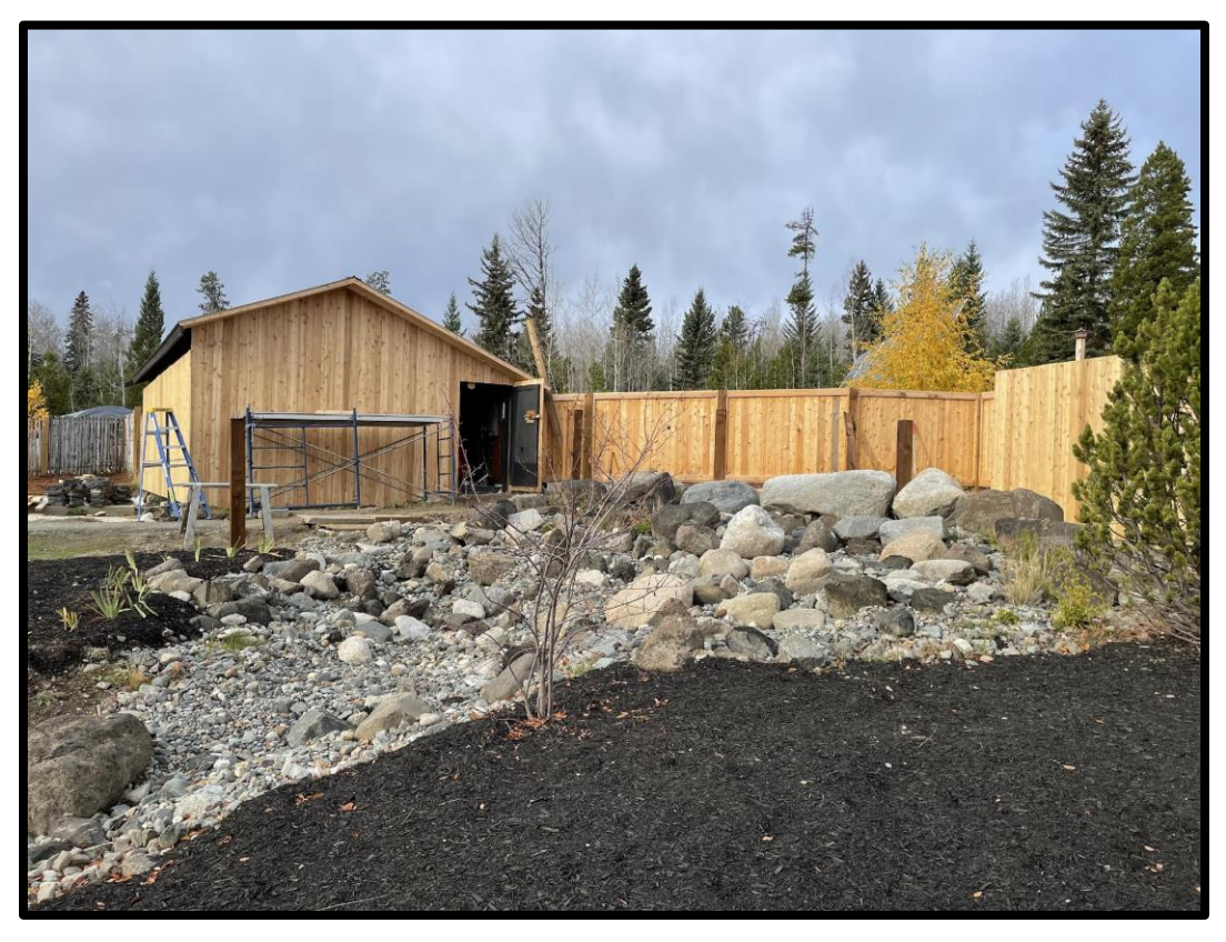
Cedar fence and workshop siding