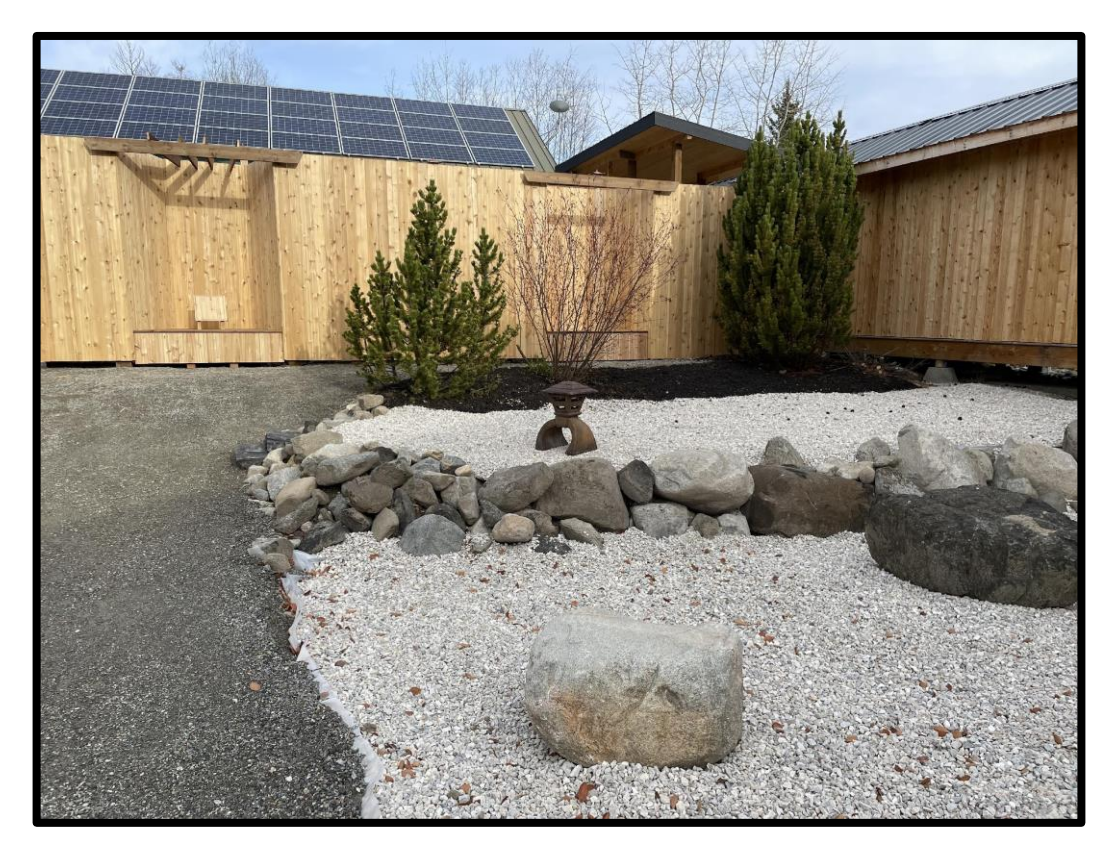
Cedar benches and gravel garden