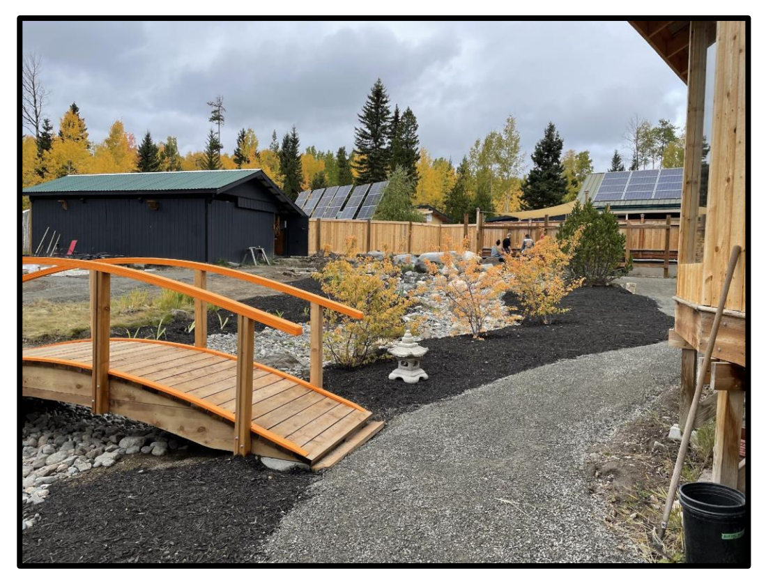
Japanese curved bridge and Saskatoon berries