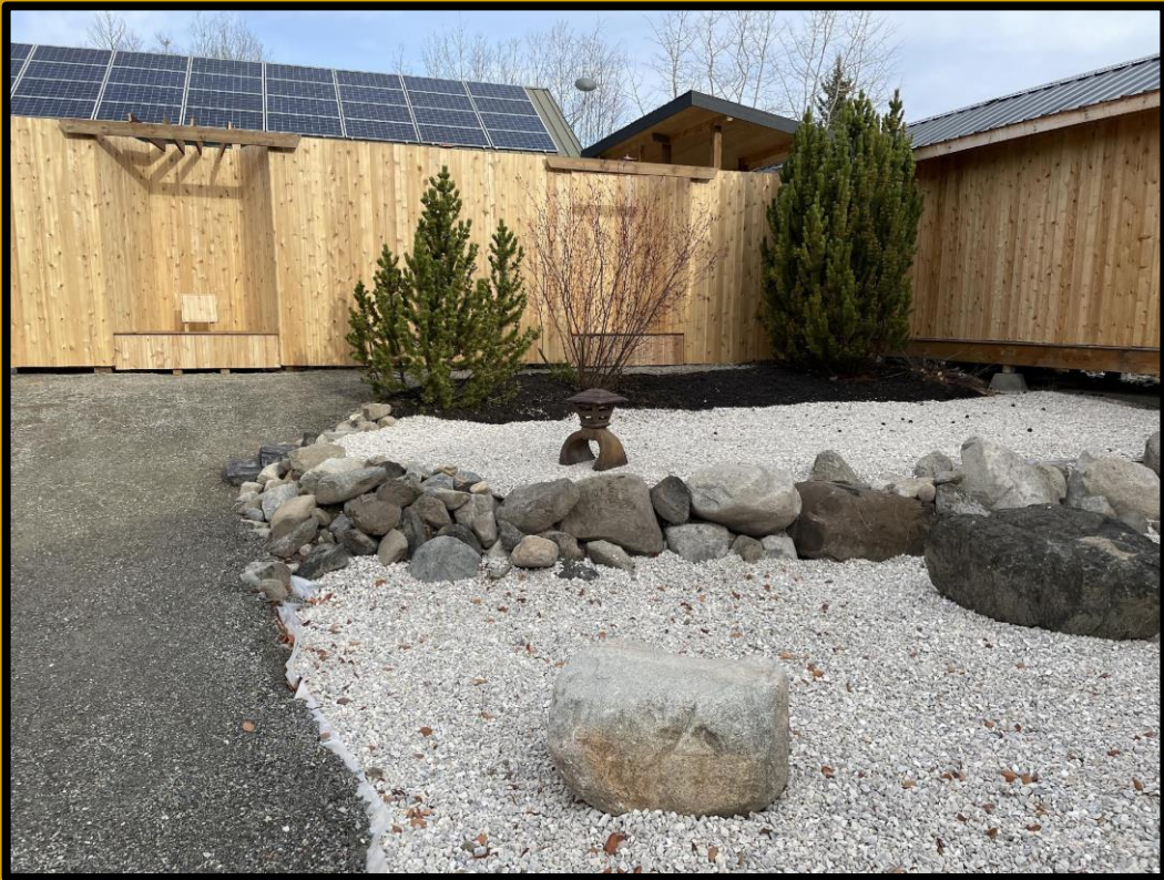
Cedar benches and gravel garden