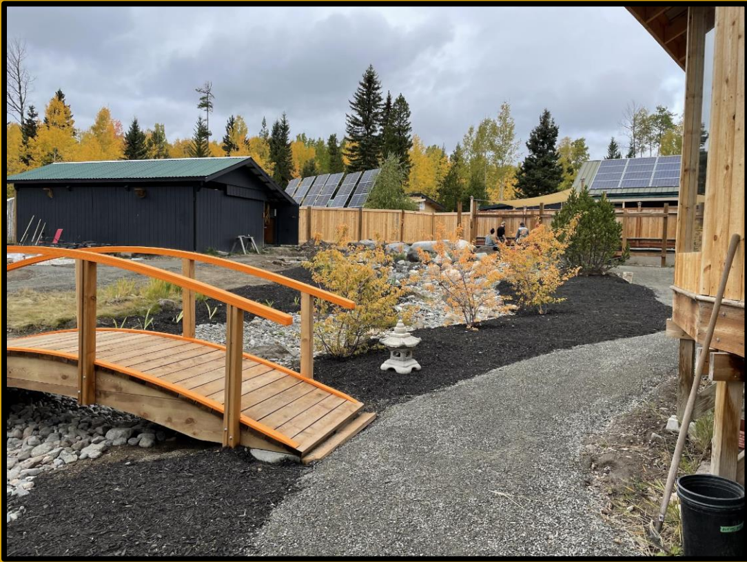
Japanese curved bridge and Saskatoon berries