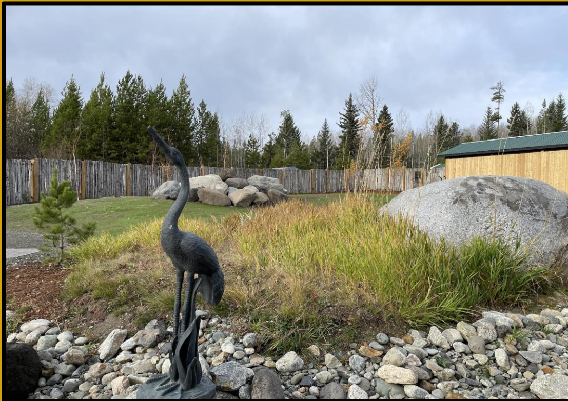
Crane and Boulder Mountain