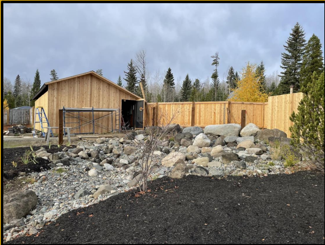
Cedar fence and workshop siding