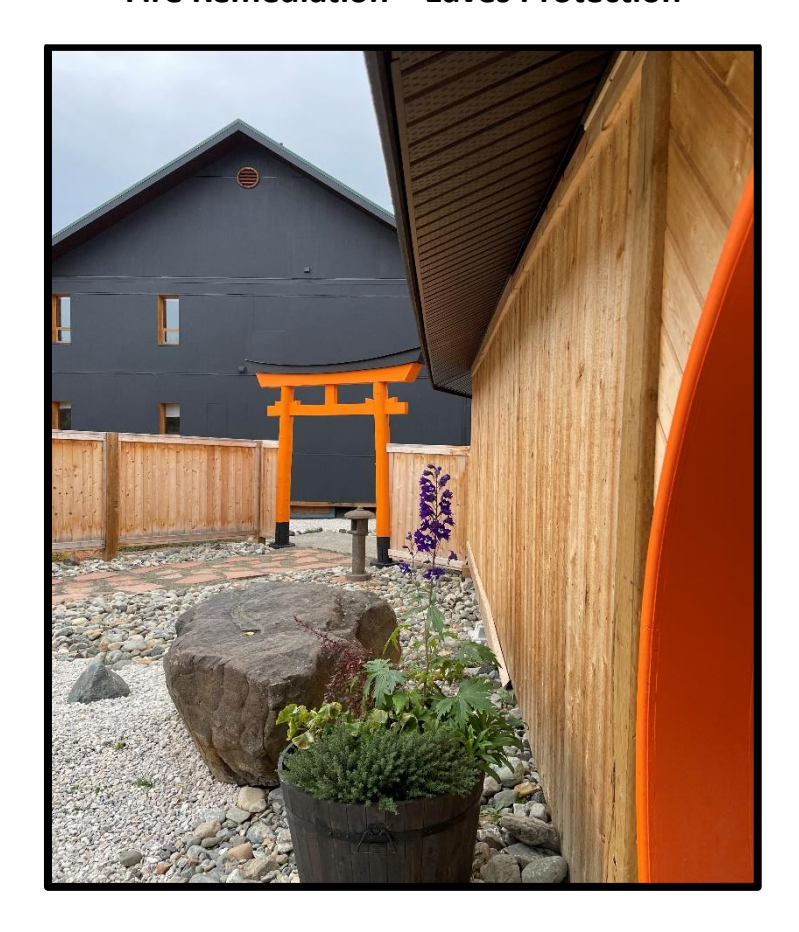
Vihara Japanese Stroll Garden