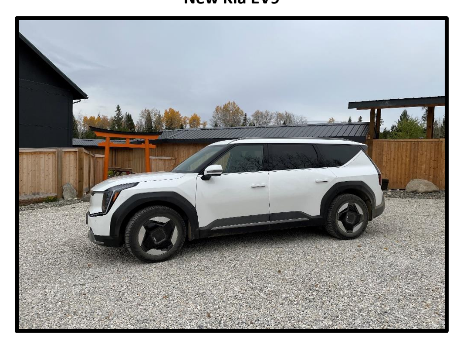
New Kia EV9

As mentioned earlier concerning the Special Resolution to lease a 2025 Kia EV9, we traded in our 2019 Mitsubishi Outlander PHEV (Plug in Hybrid Electric Vehicle) as part of that lease. Now we have an all electric vehicle that can assist in providing not only gas free transportation to town, but a means to also aid in charging our off grid battery system to run the entire monastery (see photo below). Plans are to add another all electric vehicle to our fleet in the coming year or two.